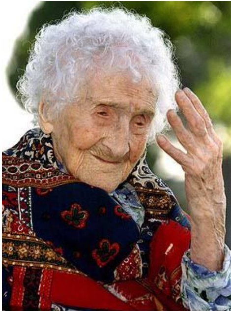
Jeanne Calment (122)

“The keys to long life are olive oil and port wine.”